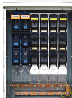
Power distributor 1,000 A