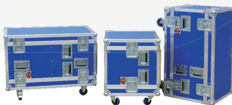
Other flightcase distributors